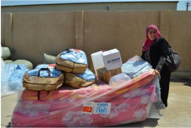
Distribution of CRIs in Mansour district of Baghdad

As a part of the coordinated response efforts of the UN in Abu Ghraib, UNHCR has distributed 200 CRI kits out of the initial allocation of 300 kits to IDP families displaced from Al Theban and Al Ma'ameel to Abu Ghraib district due to the floods. The remaining 100 CRI kits will be distributed post elections. Additionally UNHCR is planning to provide cash assistance to 400 new IDP families from Abu Ghraib.