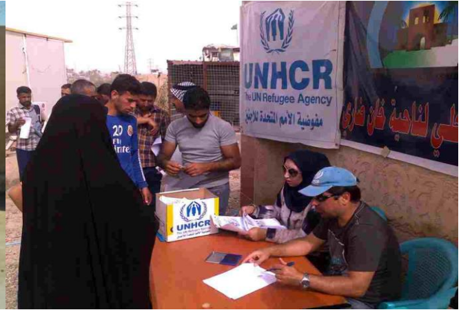
Distribution of CRIs in Abu Ghraib