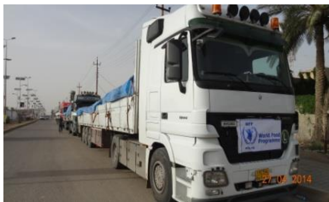
Food Transportation to Abu-Ghraib

WFP dispatched 1,500 food parcels (98MT) from their warehouse in Erbil to Abu Ghraib as part of the UN coordinated efforts to address the immediate needs of those affected. The WFP food parcel can support a family of 5 for one month.