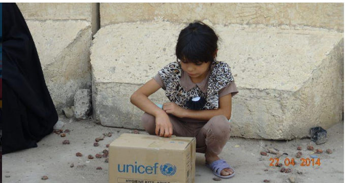
Distribution of hygiene kits in Abu Ghraib