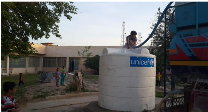
Water trucking in Heet District-Anbar