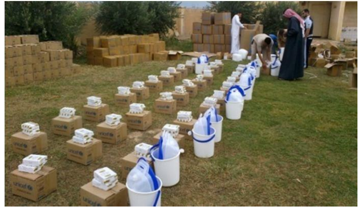
Distribution of high-protein biscuits by ISHO in partnership with UNICEF

ISHO, in partnership with UNICEF, distributed 130 cartons of high-protein biscuits in Therai-Dijla, along with other non-food items.