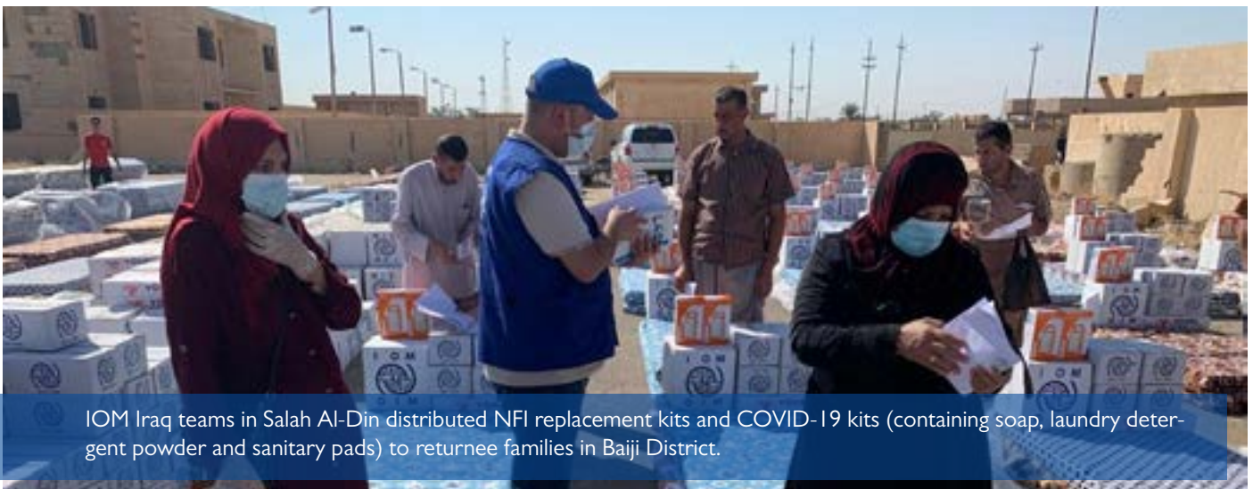
IOM Iraq teams in Salah Al-Din distributed NFI replacement kits and COVID-19 kits (containing soap, laundry detergent powder and sanitary pads) to returnee families in Baiji District.