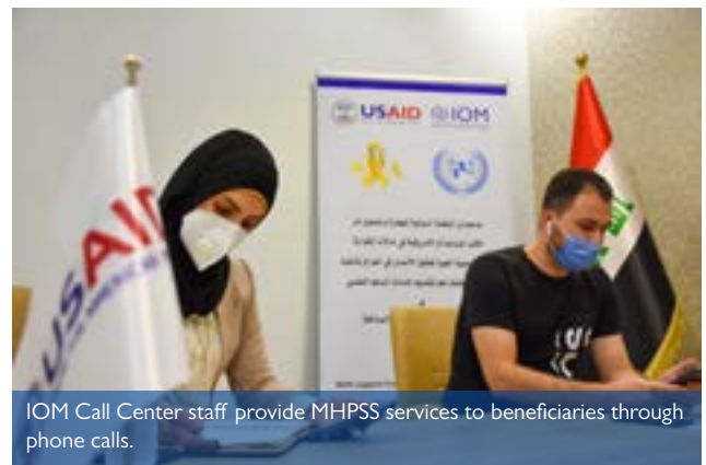
IOM Call Center staff provide MHPSS services to beneficiaries through phone calls.