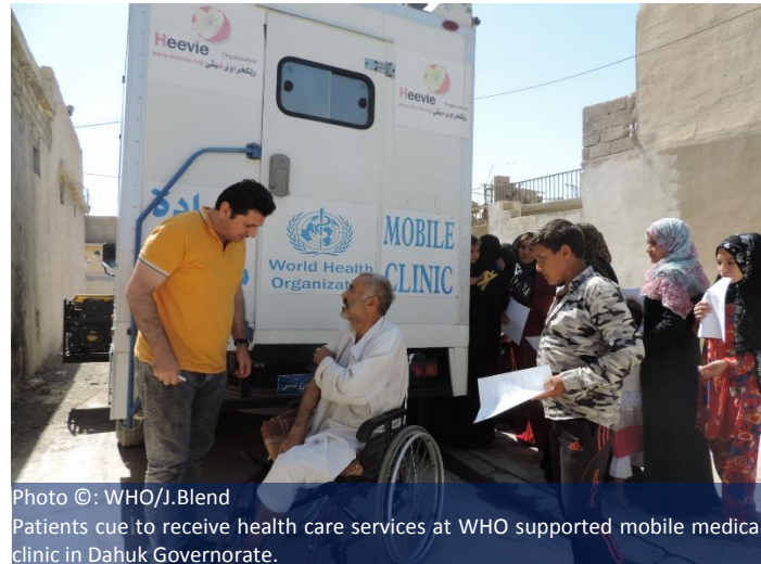
Patients cue to receive health care services at WHO supported mobile medical clinic in Dahuk Governorate.