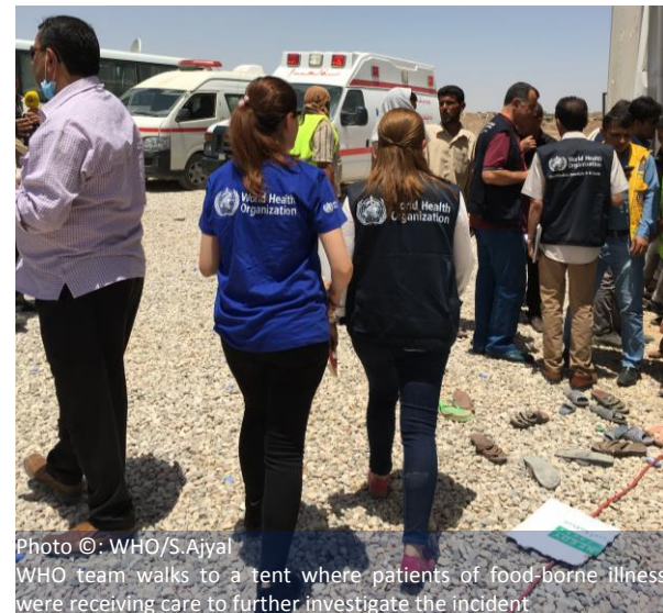
WHO team walks to a tent where patients of food-borne illness were receiving care to further investigate the incident