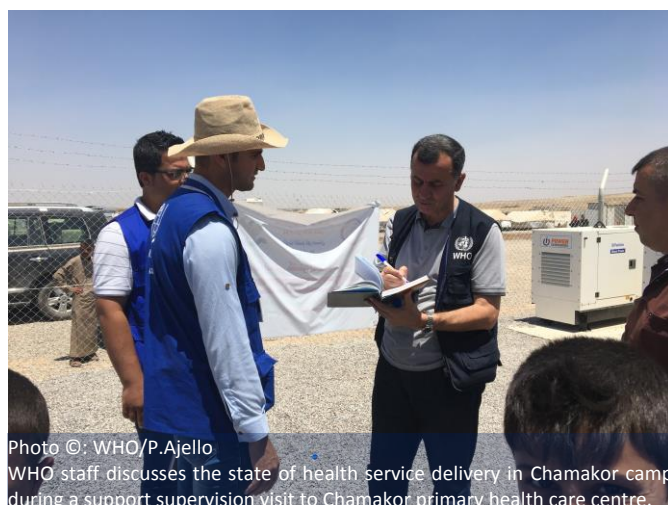
WHO staff discusses the state of health service delivery in Chamakor camp during a support supervision visit to Chamakor primary health care centre.